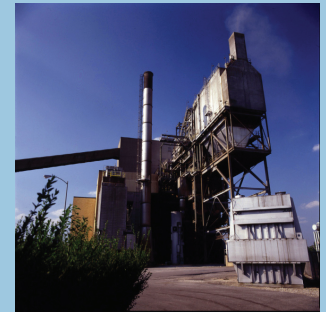
Chamois Power Plant